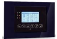
Latest generation control panel.